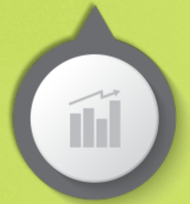
NEW BRAND DIRECTION