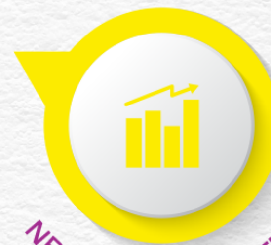
NEW BRAND DIRECTION