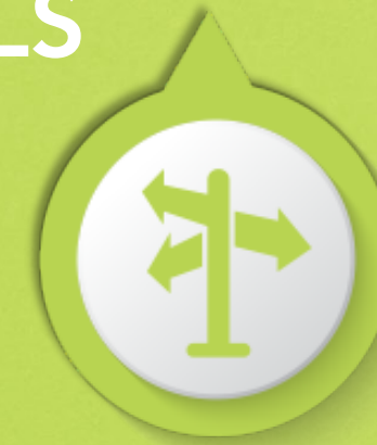
CURRENT BRAND DIRECTION