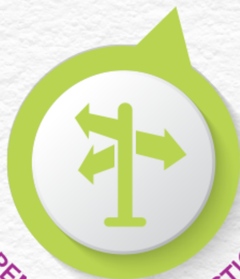
CURRENT BRAND DIRECTION