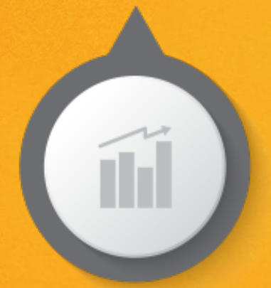
NEW BRAND DIRECTION