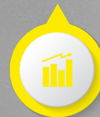
NEW BRAND DIRECTION