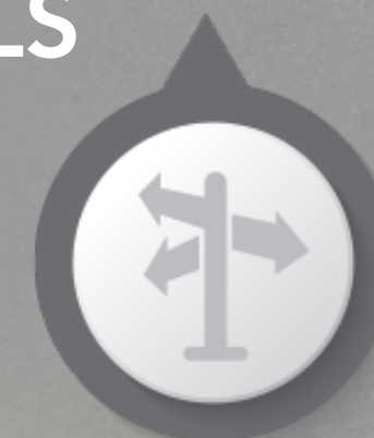
CURRENT BRAND DIRECTION