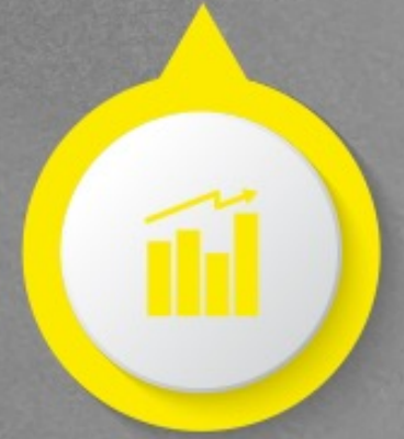
NEW BRAND DIRECTION