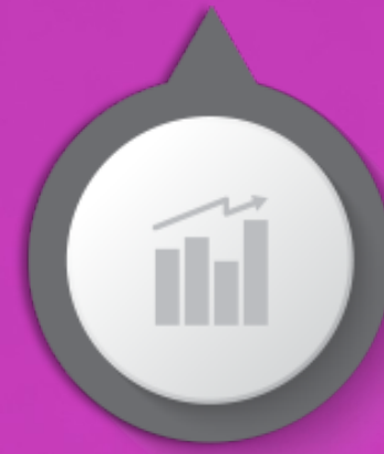
NEW BRAND DIRECTION